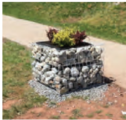
30" Gabion Planter Installation

Life Scout Patrick O’Rourke and Patrick’s Dad, Brian completed the first of what will ultimately be 50 modular gabion structures. These gabions will be used in a variety of configurations as planters and benches in the installation.