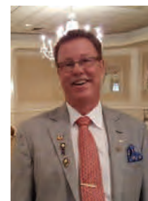
Charles Minton Governor

If you have been following my postings on Facebook, you can see the joy in everyone's face as I take a class picture with the Club.